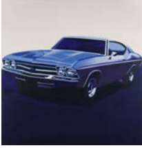
6 Untitled 1989 Oil on linen 46 x 44 inches 117 x 112 cm